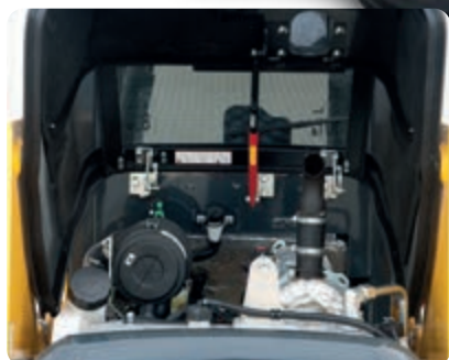
Easy access to daily maintenance points

Routine maintenance and check-ups can be performed by simply opening a rear bonnet that also allows the user to clean the inclinable radiators. For extra servicing, the tilting cab offers complete access to the transmission and to the main components of the hydraulic system. Special self-lubricating bushings increase the greasing intervals for all pins up to 250 hours.