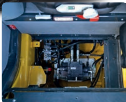
Thanks to the internal cab bonnet, extra servicing of the main valve can be done quickly without tilting the cab