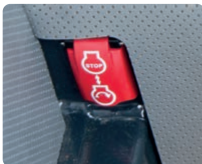
Secondary engine shutdown switch