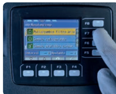
Basic maintenance screen on the 3.5" multi-colour monitor